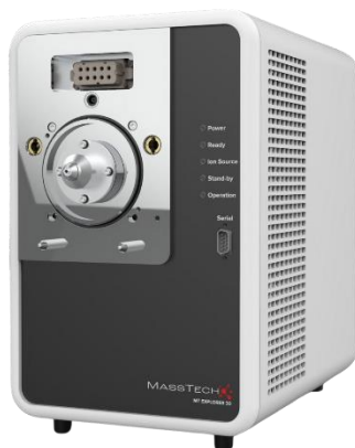
MT Explorer 30 Mass Spectrometer

A cannabinol reference standard was obtained and diluted to a working concentration. Dried cannabis leaf was also obtained for direct analysis of the dried leaf sample. APCI-MS and APCI-MS/MS were employed for analysis on the MTE 30. 2 \mu\text{L} of samples were introduced to the source via micropipette and evaporated by infrared heating.